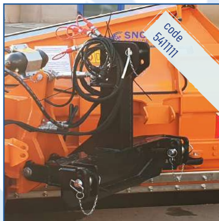
3-point hitch forklift attachment to be bolted on the DIN plate