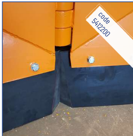
Rubber cutting edges (250x50)