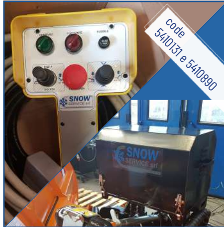
24V electro-hydraulic power (optional) unit equipped with cable and push-button panel (6+1 stations or 8+1 stations) to be matched with the code 5410910