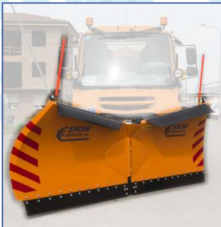
Working position 4 LEFT BLADE