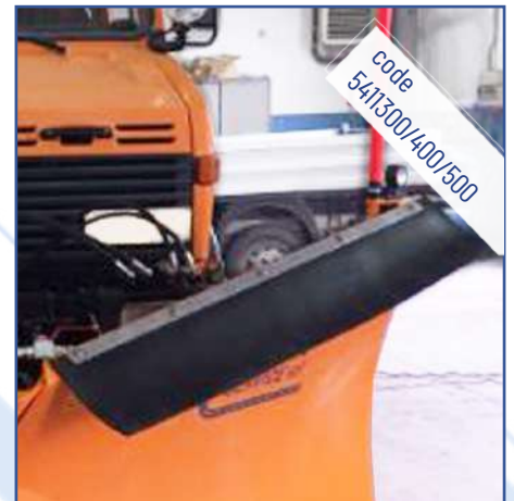
Upper rubber splashguard (optional)