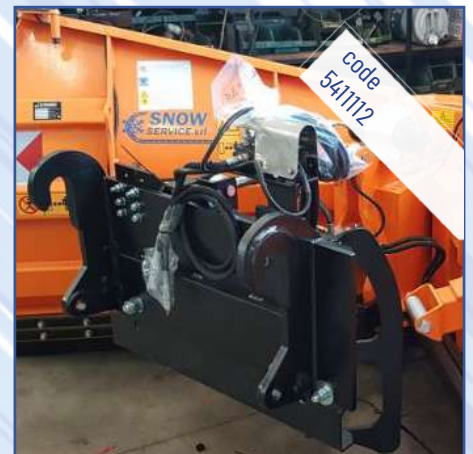
Attachment for operating machines (backhoes, loaders) to be bolted on the DIN plate