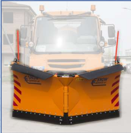
Working position 1 WEDGE-SHAPED/V MODE