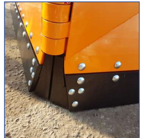
Anti-shock bumpers system on the tip