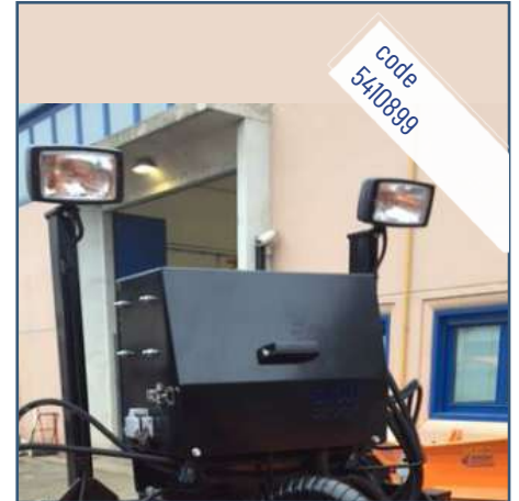
Pair of additional lights mounted on the DIN plate