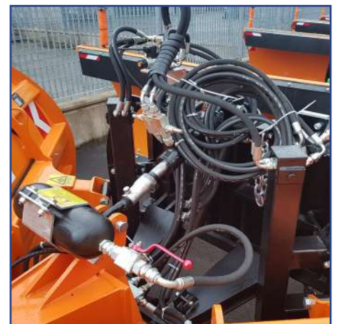
Nitrogen accumulator to reduce the side shock loading