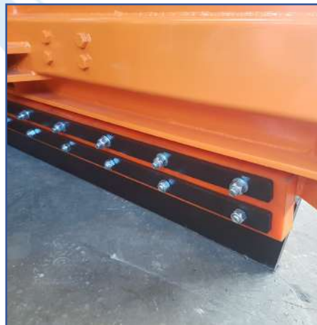
Anti-shock polyurethane bumpers system on the bottom cutting edges