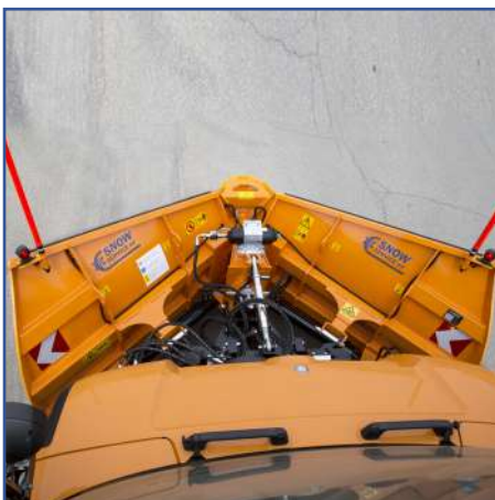
"V" position 45° working angle