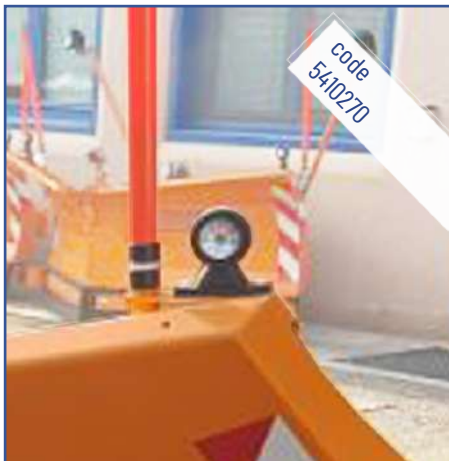
LED side-marker lights