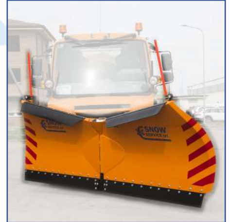
Working position 3 RIGHT BLADE