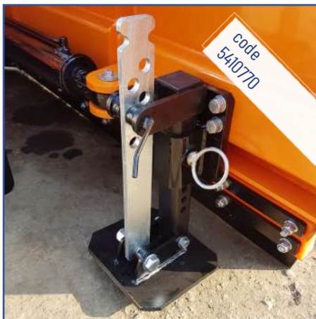
Pair of slides adjustable in height