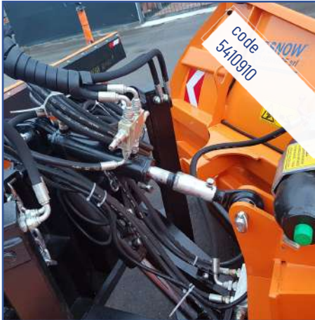
Double-effect hydraulic cylinder (optional) to manage the automatic adjustment and the front shock absorbing system (necessary a 4th hydraulic line)