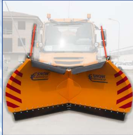
Working position 2 SCOOP MODE